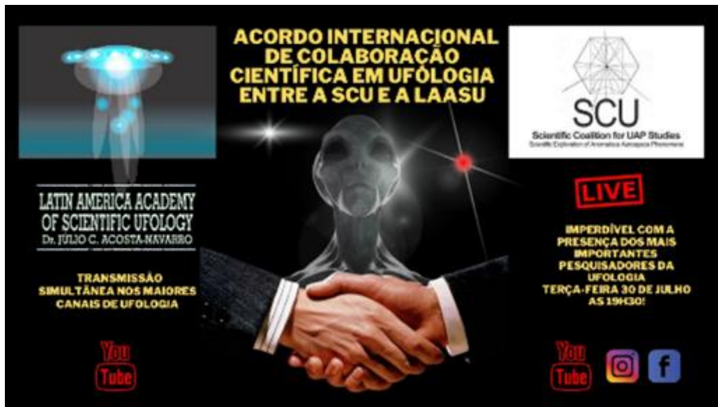
Figure 4 International live announcement of the scientific cooperation agreement (North-South Hemispheric) between the "Scientific Coalition for UAP Studies" (SCU) and the "Latin American Academy of Scientific Ufology" (LAASU) (July 2024)