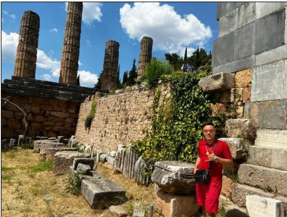
Figure 3 Marcus Aurelius on the visit to the Oracle of Delphi (Greece), previously the Parthenon in Athens and later Santorini Island and Crete Island (August 2022)

Trajectory documented in Table 1 demonstrates that present work does not emerge from abstract speculation or recent interest but represents synthesis of forty-seven years of intellectual development, empirical investigation, rigorous academic training, and profound personal experiences. This transparency about author positionality allows reader to evaluate context of hypothesis emergence and recognize that, although personal experiences inform perspective, methodological rigor (systematic textual analysis, twelve-criteria application, integration with established literature, comparison with other hypotheses) maintains throughout work. Homeric Theater Hypothesis is simultaneously deeply personal and rigorously scientific—characteristic that, instead of representing contradiction, exemplifies fruitful integration between lived experience and systematic analysis.