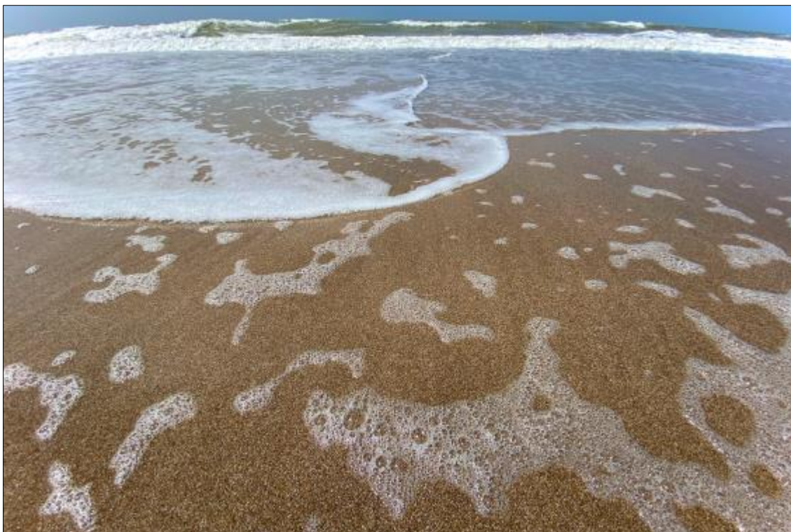
Figure 5 Untitled series “Worlds”, 2024

If we do it from the memory of what we have learned socially, morally and culturally, even from what we have learned academically, we will continue going around in circles, dividing, responding and decoding the past, on the basis of what has been established up until now. We will continue to believe that there is an inside and an outside belonging to two natures. Consciousness is one, expressing itself in myriads of singularities that can already be aware of its creative power, the basis of which is Love, the tangible certainty that one is all. If we begin to exercise presence connected to earth, to our bodies and pure sensations, open to receive frequency codes from the sky, we will begin to act from what is new, from action that happens in the present, integrating all the components of the moment in a way never seen before and unique. Creative presence is inspiration.