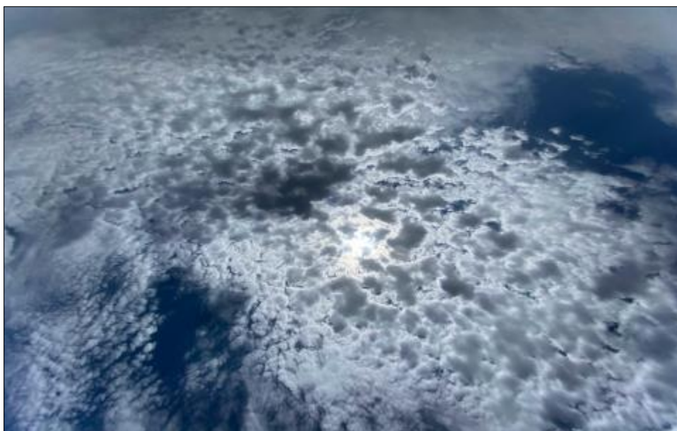
Figure 3 Untitled series "Worlds", 2024

It is pure, unconditional love, everything revolves around this extraordinary fact, human nature. Identification and respect for life like in Mayan culture. They promote that we all recognize each other as brothers, establishing a series of principles values, and attitudes that promote it.