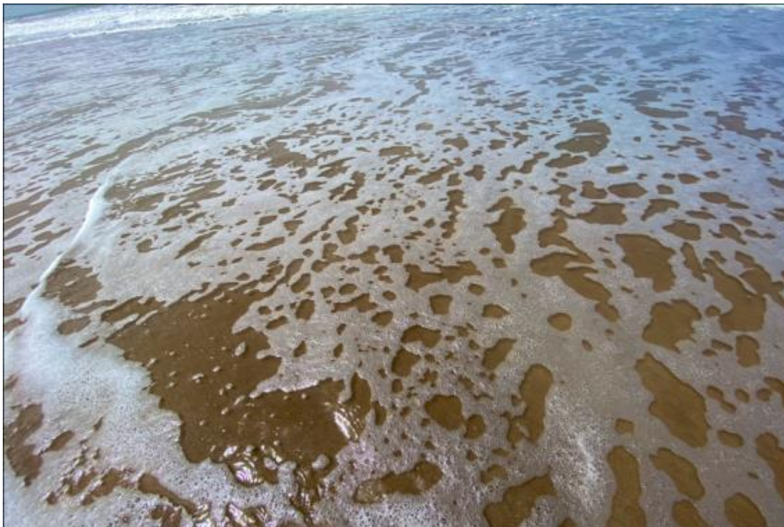
Figure 2 Untitled series “Worlds”, 2024

It involves ego judgements, such as observing and stopping, whenever we can, which requires sustained attention to present [16]. Martial arts provide this silence with their movements, conscious breathing, meditation, and often repetitive actions help to reach a state of suspension of thoughts to get in touch with our creative part.