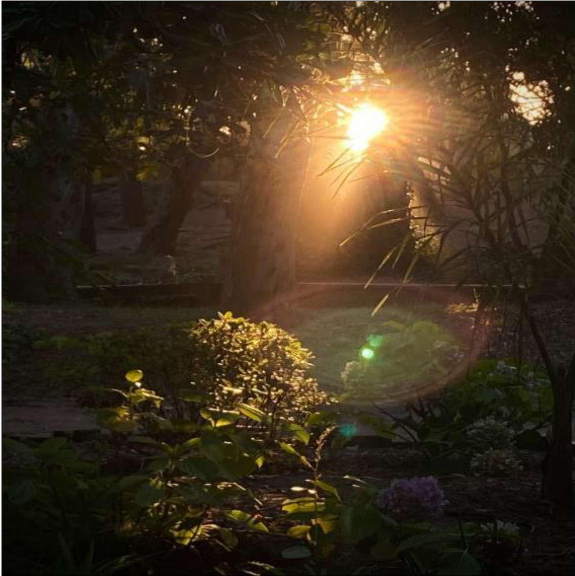
Figure 4 Untitled series “Worlds”, 2024

Nature has a sacred character for Mayan, since it is the most kind and extraordinary expression of Mother earth. Nature should be the protagonist during daily activities.