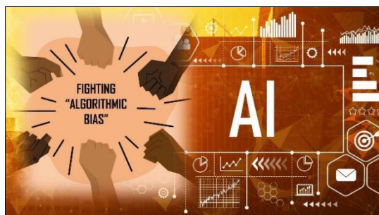
Figure 1 The use of AI in fighting algorithmic bias

Biases in algorithms have their roots at the point of data collection when datasets are not diversified, embedding systemic prejudices in AI systems. These issues are further impaired by model design when features or variables are chosen to relate to biased outcomes. Furthermore, contexts of deployment increase these inequities through irregularities in technology access and regional disparities into biased outcomes that don't equitably serve underrepresented populations.